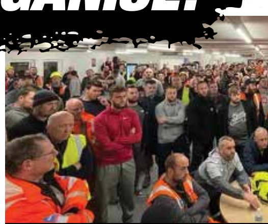
OUT WITH THE TORIES