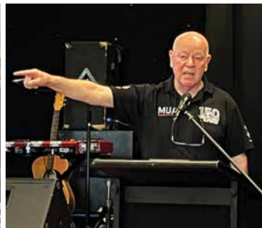
MUA 150 YEAR ANNIVERSARY DINNER QUEENSLAND