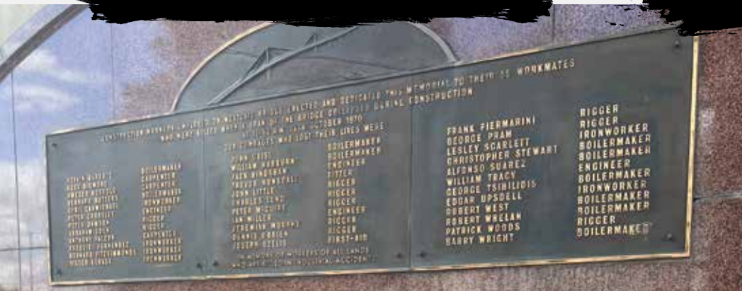
WESTGATE BRIDGE MEMORIAL SERVICE