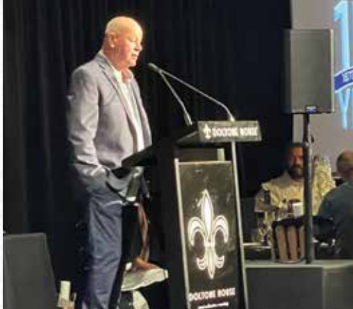
MUA 150 YEAR ANNIVERSARY DINNER SYDNEY