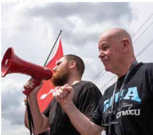
SPEAKING ON THE KNAUF PICKET LINE