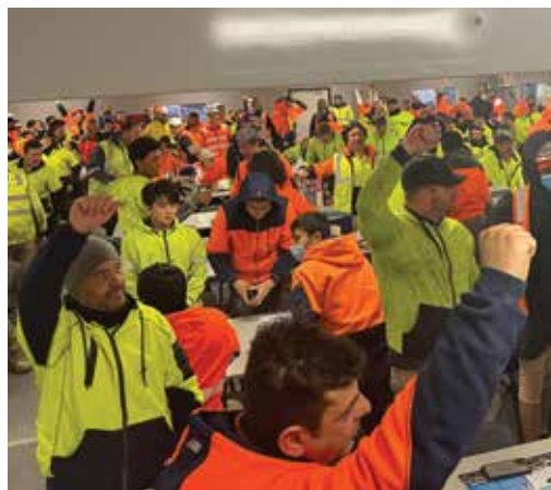
CONSTRUCTION MEETING NSW