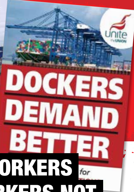
LIVERPOOL DOCKERS PICKET LINE