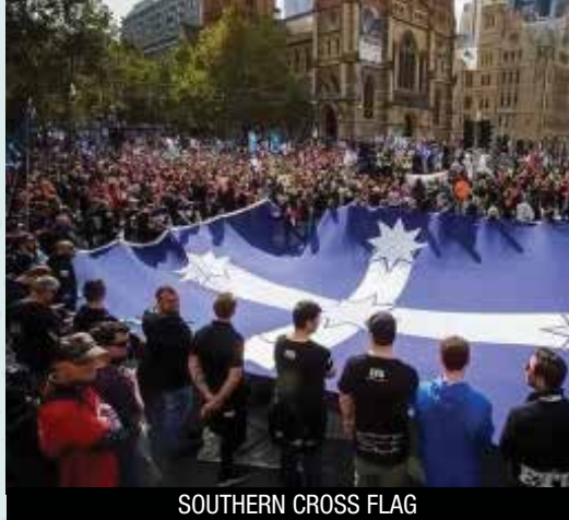
SOUTHERN CROSS FLAG