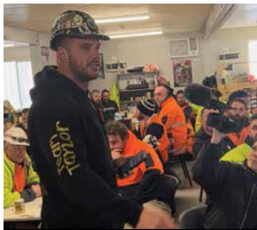
FOOTSCRAY HOSPITAL, VICTORIA