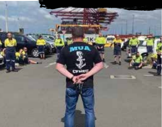
PAUL KEATING MUA WHARFIES, SYDNEY