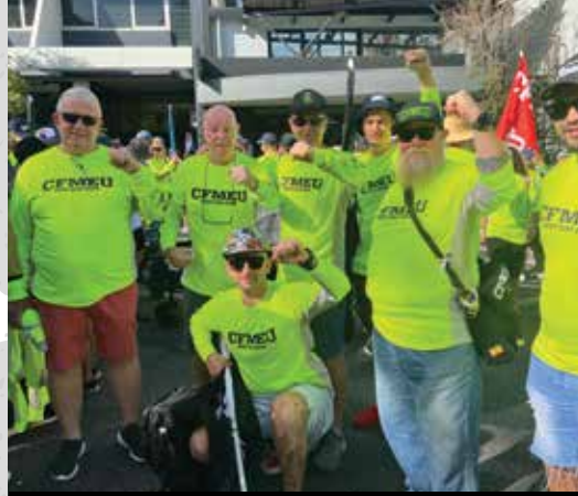
BRISBANE MAY DAY RALLY