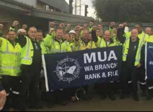
MUA WHARFIES RANK & FILE, WA