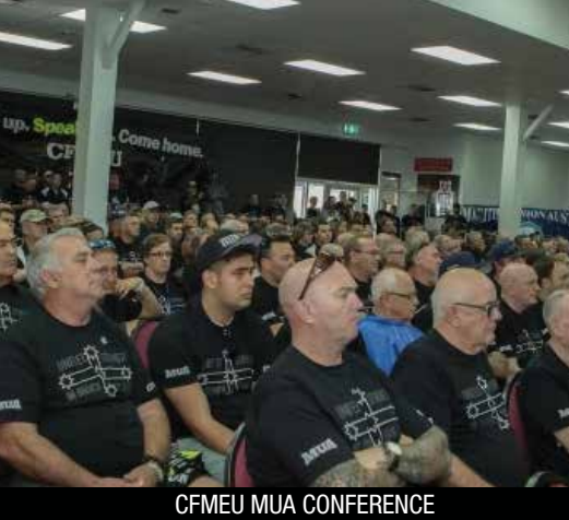
CFMMEU MUA CONFERENCE