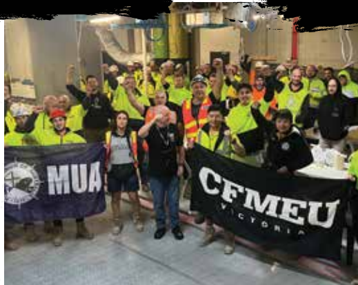
MUA WHARFIES, WA