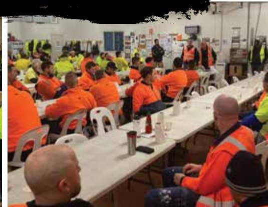
CONSTRUCTION MEETING, WA