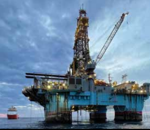
OFFSHORE MAERSK PLATFORM