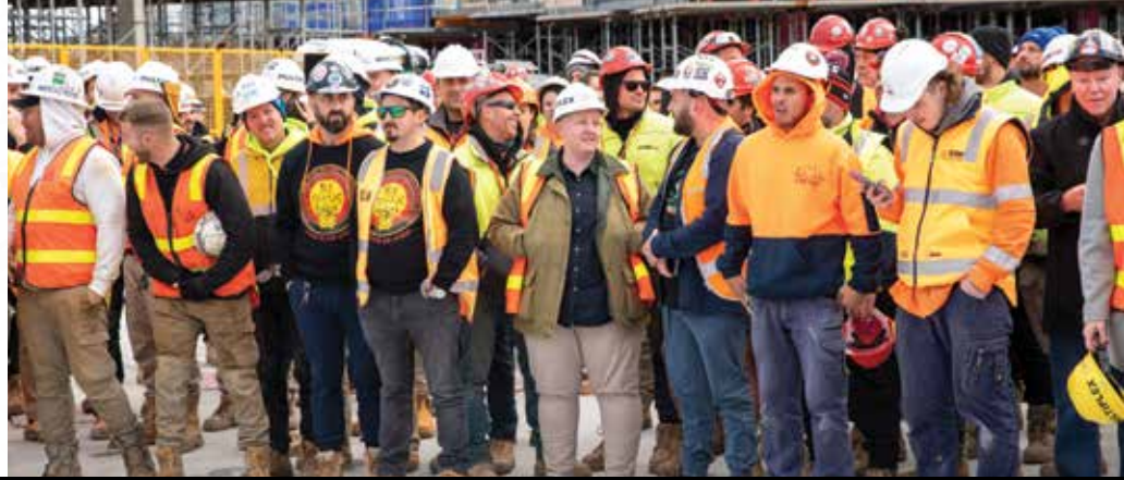
FOOTSCRAY SMOKING CEREMONY, VICTORIA