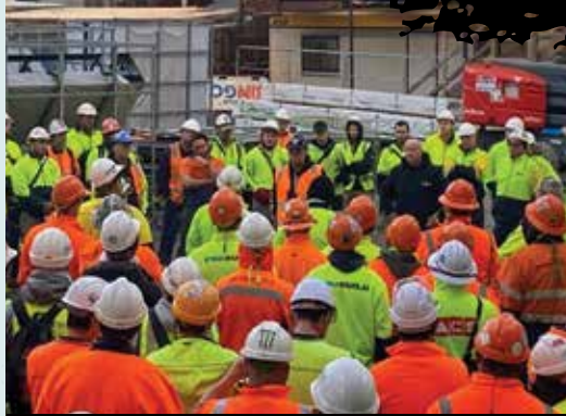
CONSTRUCTION MEETING, SYDNEY