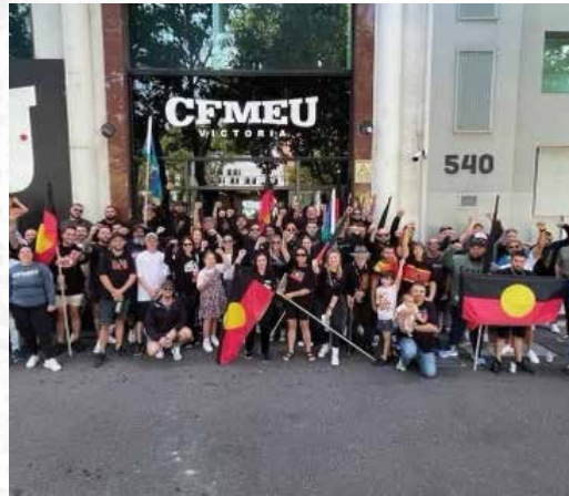
VIC CFMMEU SUPPORTING THE FIRST NATIONS PEOPLES RALLY