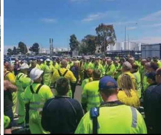
MELBOURNE WHARFIES AT DP WORLD