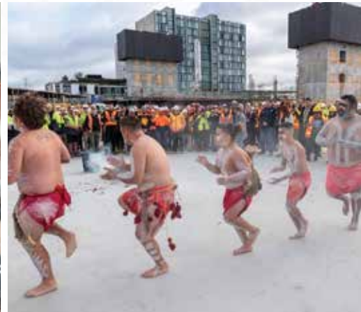
SMOKING CEREMONY FOOTSCRAY HOSPITAL