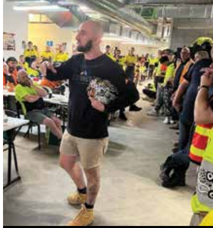
SIMO IN ACTION - SITE MEETING MELBOURNE