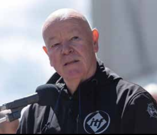
GETTING OUT THERE ADDRESSING THE MEMBERSHIP!