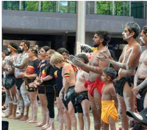
INDIGENOUS RALLY PERTH