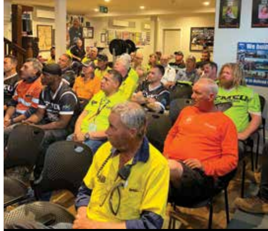
DELEGATES MEETING PERTH