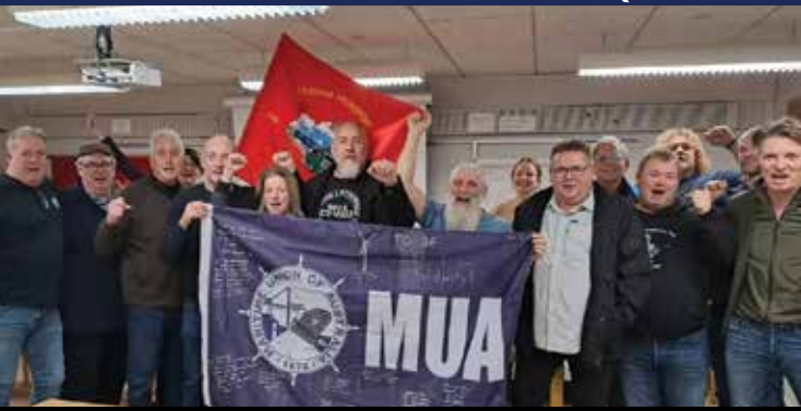
MUA DELEGATION TO DENMARK