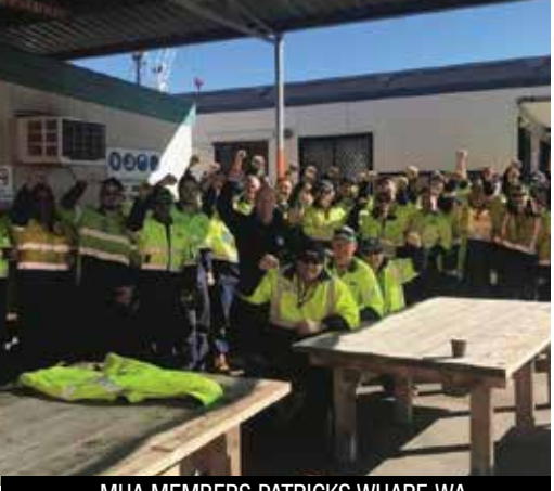
MUA MEMBERS PATRICKS WHARF, WA