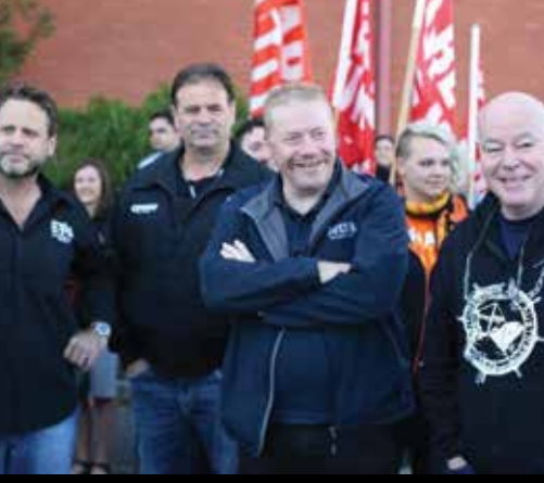
REMEMBERING ON THE PICKET CUB DISPUTE IN MELBOURNE